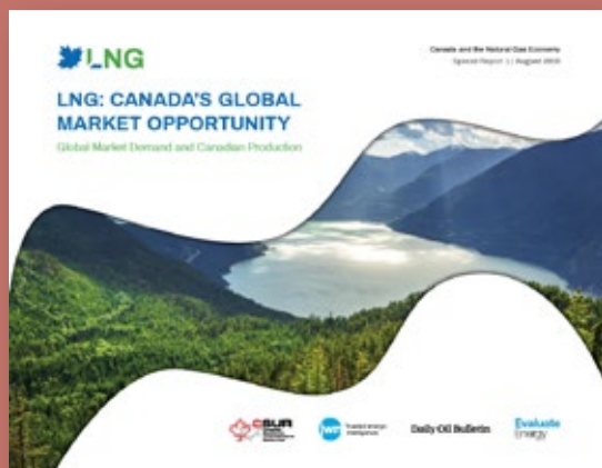
LNG: Canada's Global Market Opportunity