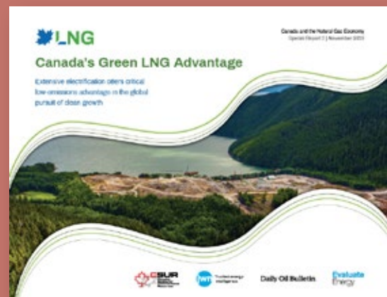
Canada's Green LNG Advantage