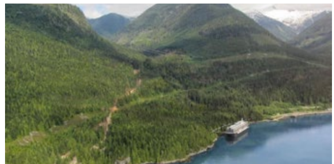
Woodfibre LNG is proposing to house workers in a self-contained “floatel.”

“It [Lelu Island] was part of the Port of Prince Rupert,” he said. “It was zoned for industrial development. There was nothing that led us to believe that that wouldn’t be supported. In fact, the Prince Rupert port had the support of those First Nations for development.