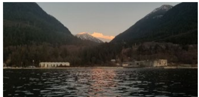
Woodfibre LNG site in Squamish, B.C.

The project was built on Crown land that had been the former site of an old hospital. The Haisla, province and